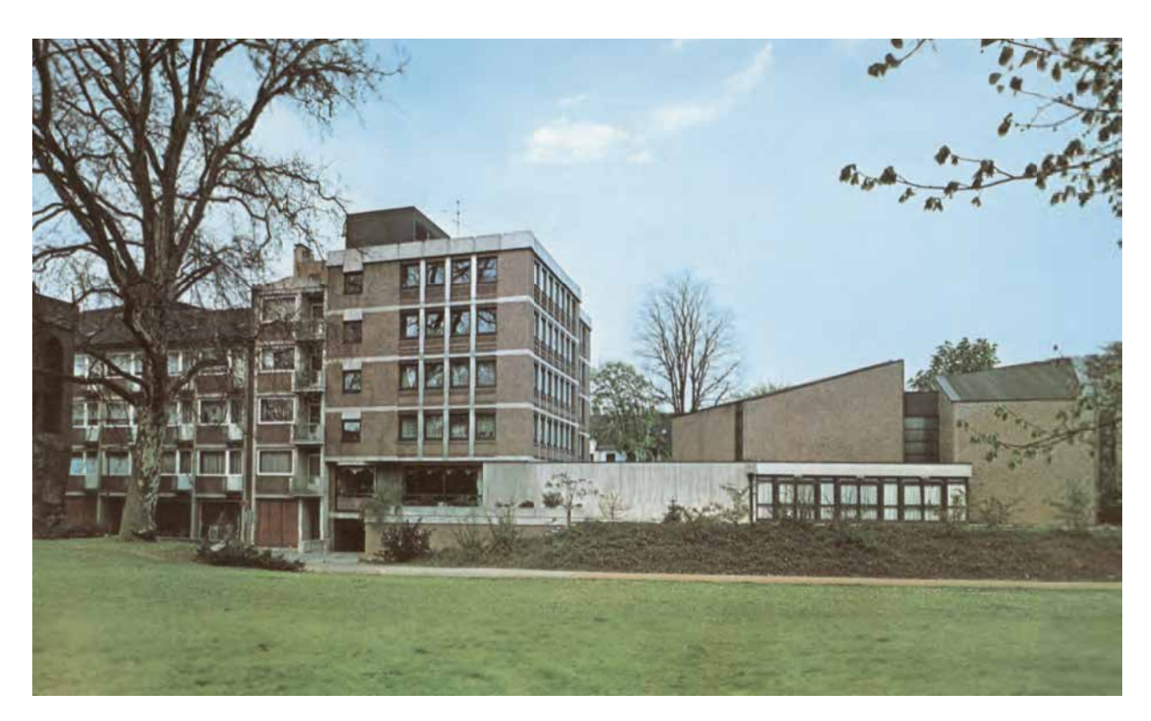
"Bürger" community centre with office building and hall, 1974