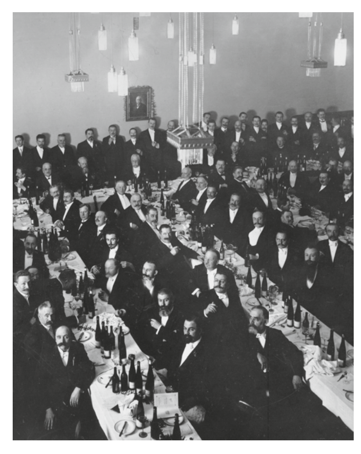
Banquet to mark inauguration of the new house, January 1910