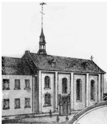
Hospital church on the westside of Brückstrasse around 1877