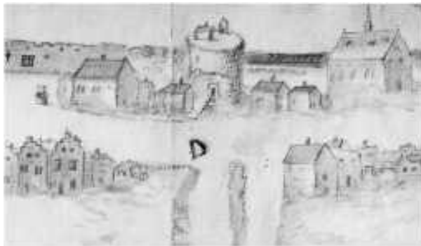
"Kehlturm" bastion and Brückstrasse in the 17th century

Rebuilt in 1721 on the east side of Brückstrasse, the 'new' Oberkloster replaced an earlier structure of 1603. Until 1583 the monastery had stood near the Obertor city gate.