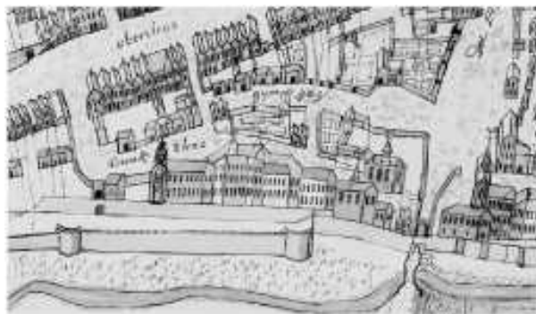
Brückstrasse in the 18th century