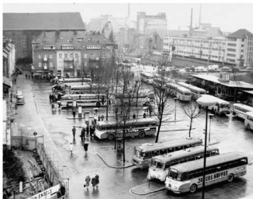
Central bus station around 1960